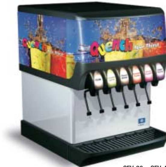
CEV-30 • CEV-40

Servend's post-mix countertop electric beverage dispensers offer maximum beverage cooling and customer-satisfying quality. The CEV series is designed for quick, easy installation with front and top access to all major components.